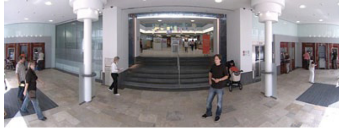
Braod view image (mounted to a wall)