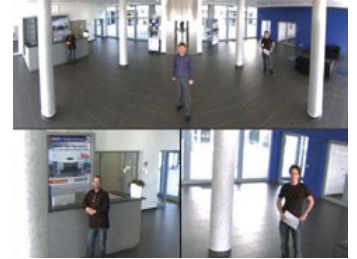
3 views simultaneously